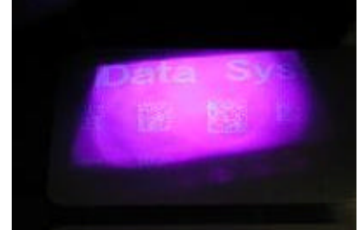
Ultra Violet barcode and text viewable with UV optics