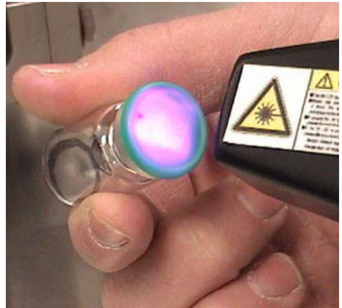
Pharmaceutical Vial with InData UV Scanner