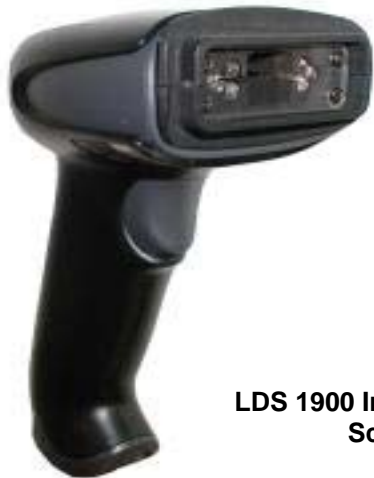
LDS 1900 Interchangeable Scanner

InData Systems is pleased to introduce a new lower cost, but more robust, scanning solution for decoding fluorescing bar code marks. Meet your security scanning needs with this new affordable scanner with interchangeable optic. With the patented optic mounted into the scanner, the new custom design performs at the same high quality as our interchangeable models. An all in one solution, the self contained scanner provides all of the benefits and features of our interchangeable optic at a more affordable price. If your requirements are for many locations, and you need quantities, this is your ideal solution.